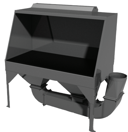
Shown at right: Model DDT-3672 with optional PVC open mesh surface matting, manifold option to single exhaust outlet, and booth enclosure with lighting.