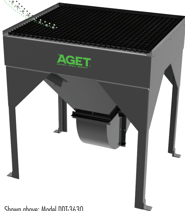
Shown above: Model DDT-3630